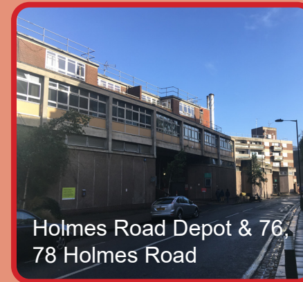
Holmes Road Depot & 76, 78 Holmes Road

The conditional sale, to Yoo Capital, is intended to act as a catalyst for the regeneration of the Regis Road area, as explained on page 4.