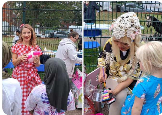
Balloon modelling and face painting