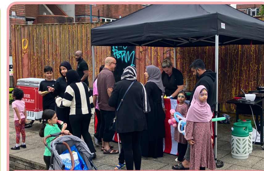
Enjoying burgers and ice lollies at the fun day