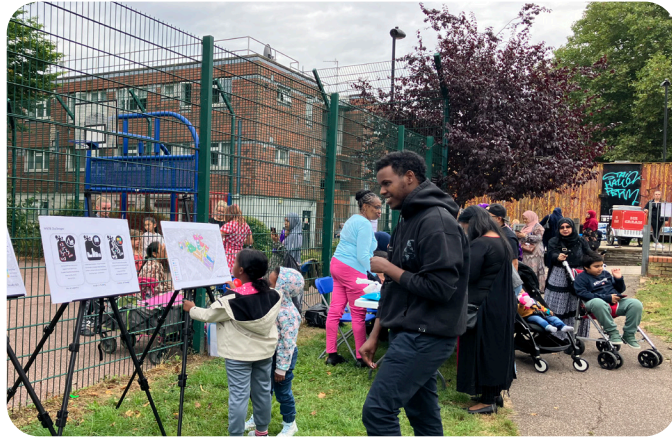
Updates on the scheme