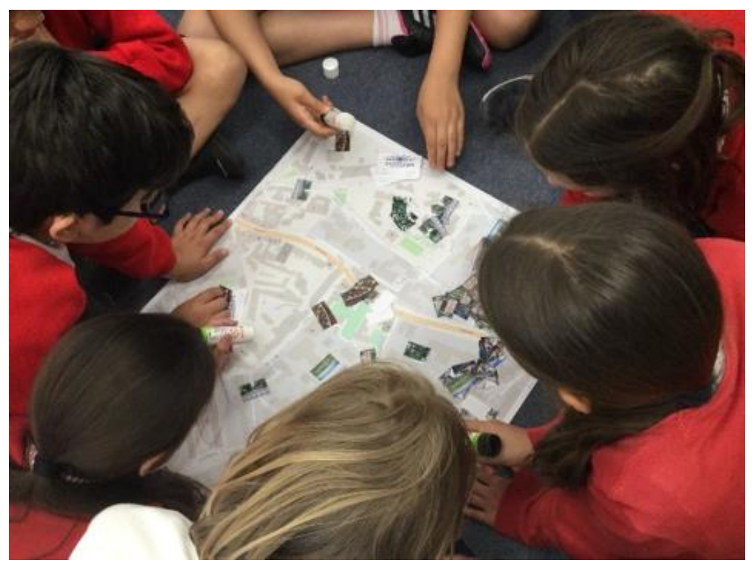
Year 6 children at Christ Church school taking part in a 2023 workshop on what they like and don't like about their local area.

Older people are well represented both in the membership and on the Forum committee. In addition, they have been prominent in the many public consultation exercises – surveys and meetings – that the Forum has carried out over the past 10 years.