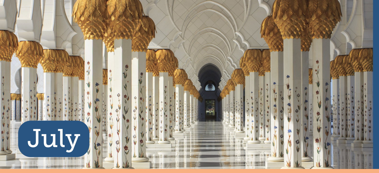
Faith and Belief

This month, we focus on recognising and celebrating all religions, cultures, and identities, and the importance of them for communities in Camden.