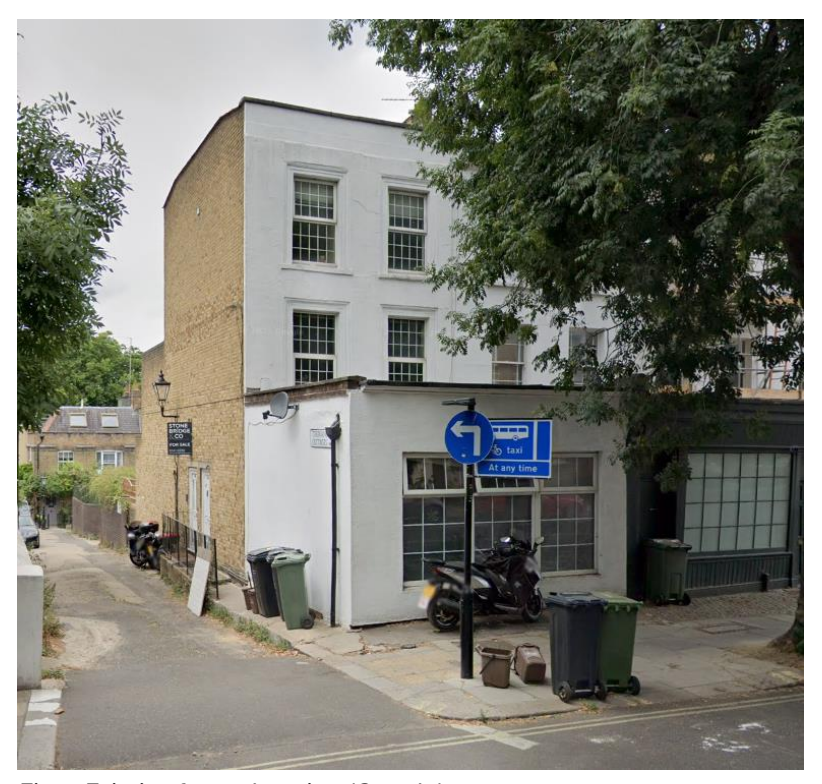
Fig 2. Existing front elevation (Google)