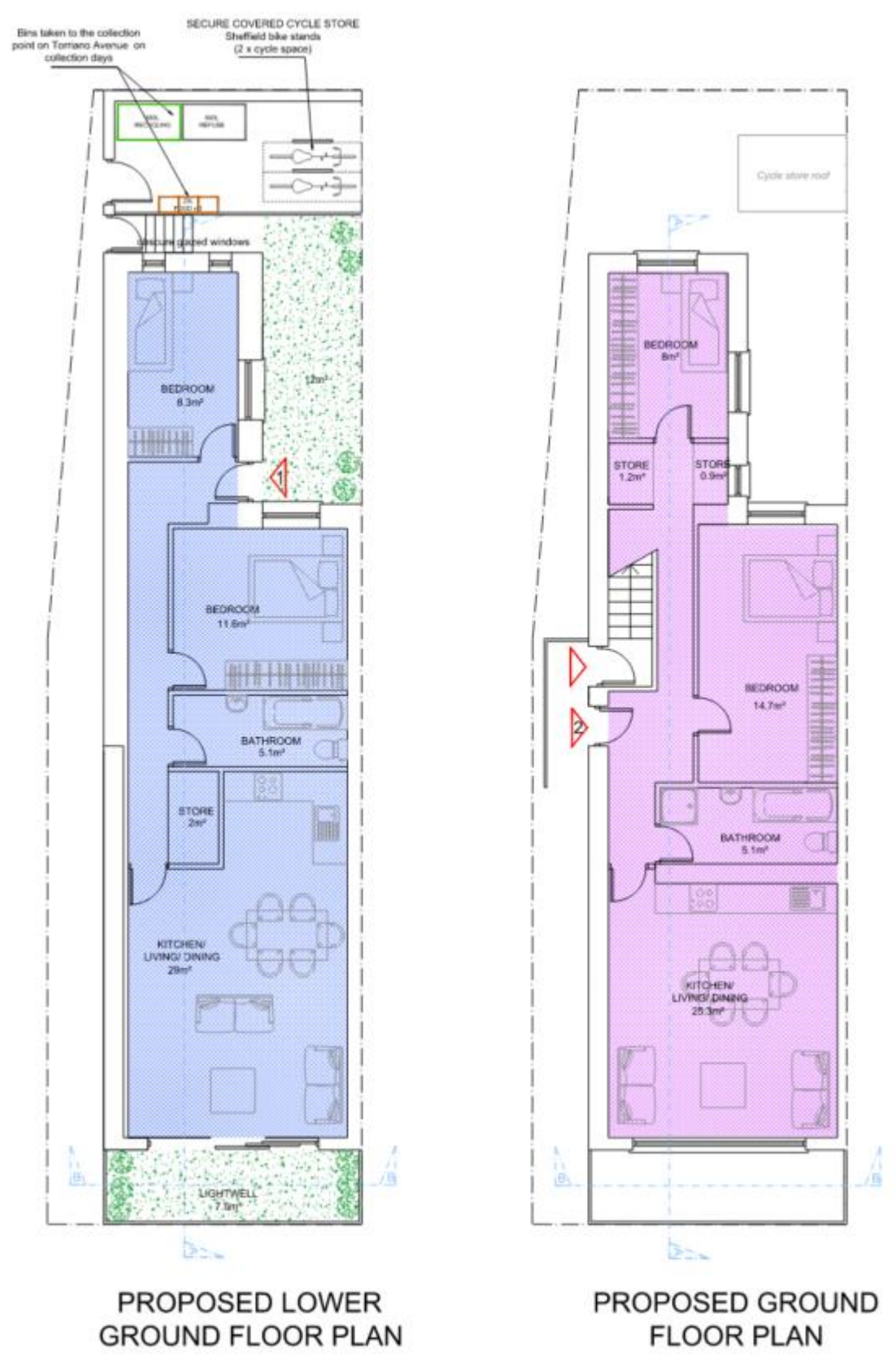
Fig 4. Proposed basement (lower ground floor) and ground floor plans.