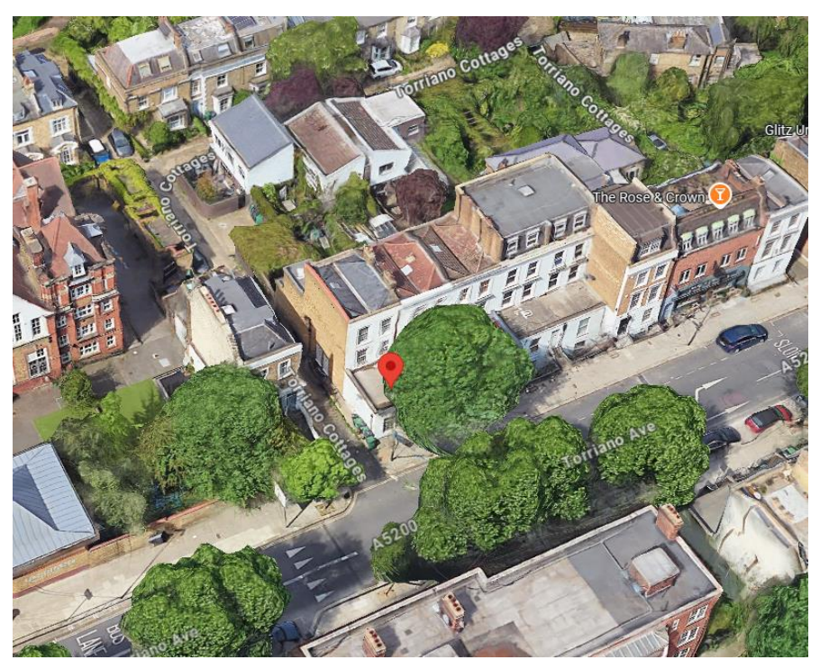
Fig 1. Aerial view of 59 Torriano Avenue