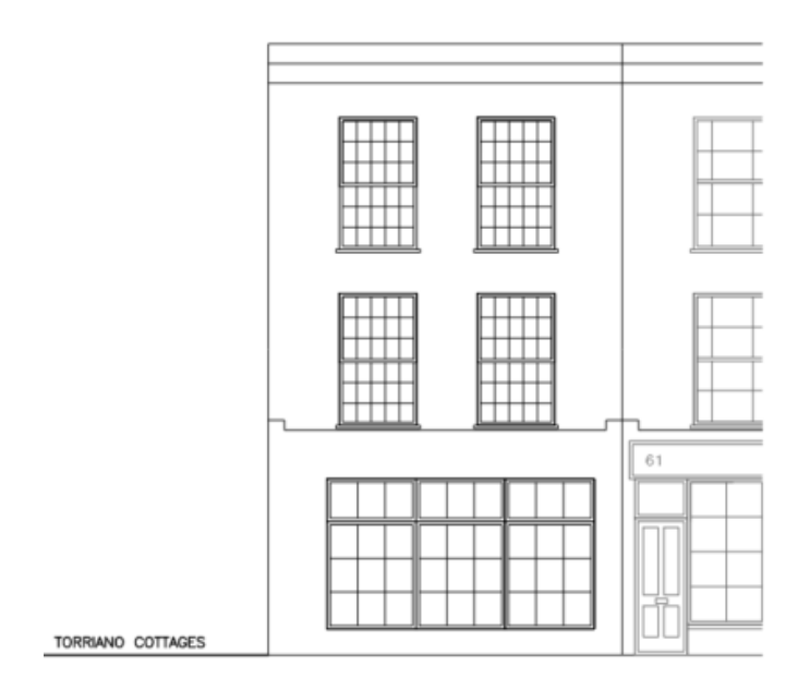
Fig 5. Existing front elevation.