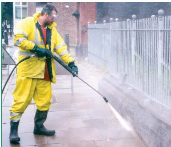
High pressure washing of Boulevard footway