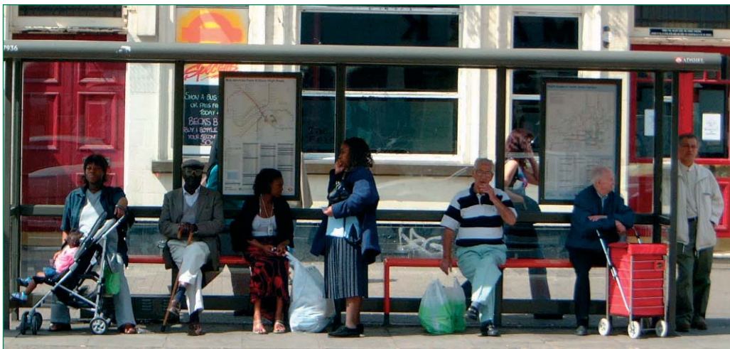
Waiting for the bus in Kilburn High Road