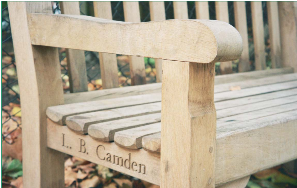
Wooden bench on the Jubilee Walk