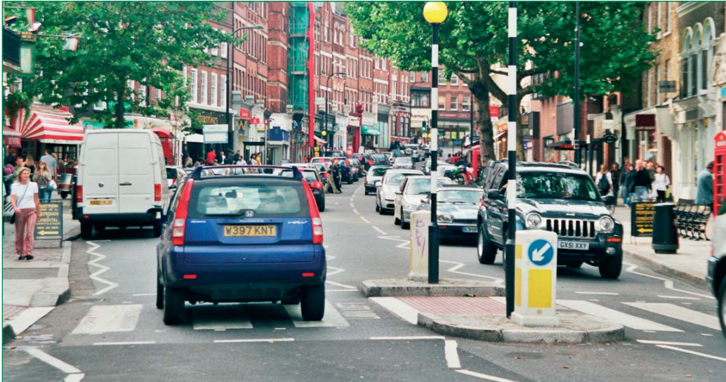
Zebra crossing on Hampstead High Street

This chapter covers design options for the carriageway, including layouts, traffic calming, crossings and carriageway markings. It also contains information on subjects that need more attention paid to them, such as drainage and materials. This section is intended to complement the Highway Works Contract and TSR&GD 2002, by providing clarity on preferred designs where variation is allowed.