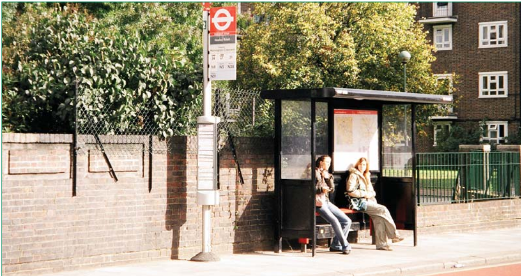
Bus shelter neatly positioned at back of footway

This chapter provides information on major items of street furniture and states preferred designs, colours and positions within the footway and carriageway. With the overarching aim of the manual being to reduce 'visual' street clutter, careful amalgamation, coordination and positioning of street furniture plays a major role in achieving this objective as well as reducing the 'palette' of materials in the street.