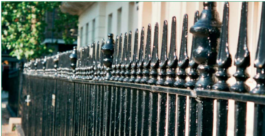
Tavistock Square railings