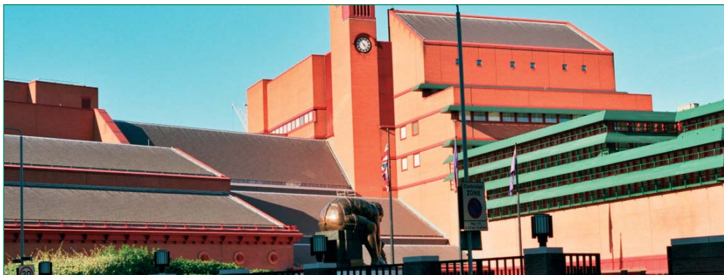
The British Library