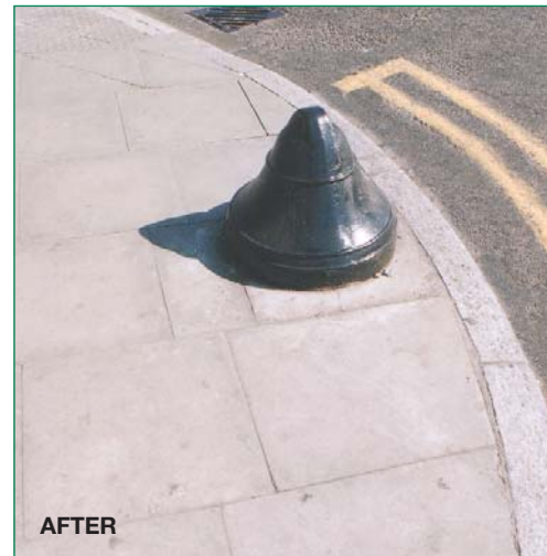
Boulevard improvements in England's Lane