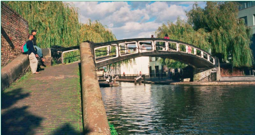
Regent's Canal at Camden Lock