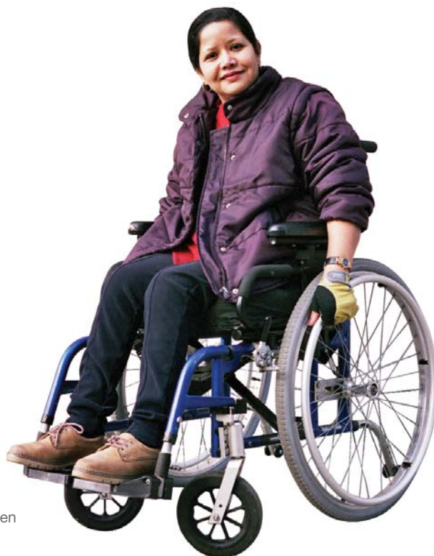
A wheelchair user in Camden