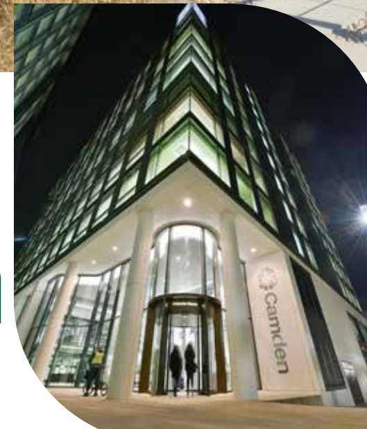
Camden Council offices - 5 Pancras Square.