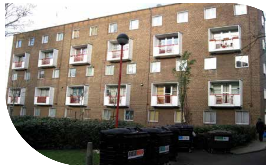
Kilburn Gate retrofitting - after