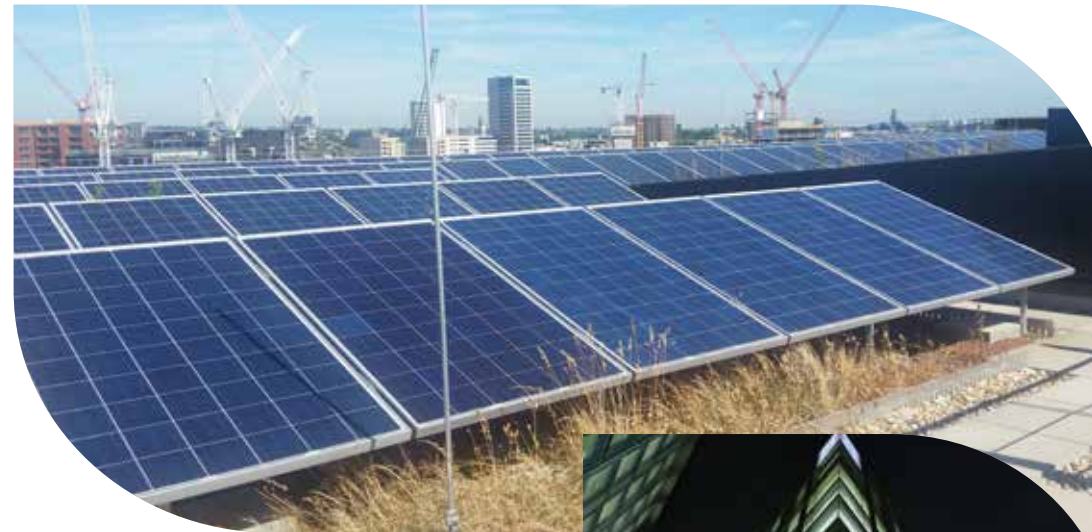
Solar panels on the roof of the Council building (5 Pancras Square).