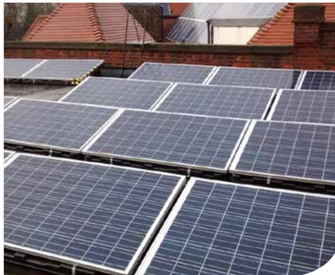
Solar panels on Konstam Nursery in Dartmouth Park.