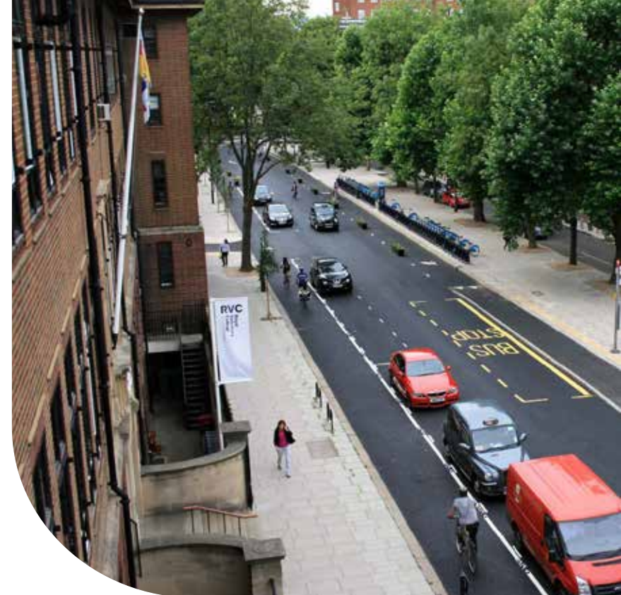
Cycle lane along Royal College Street.