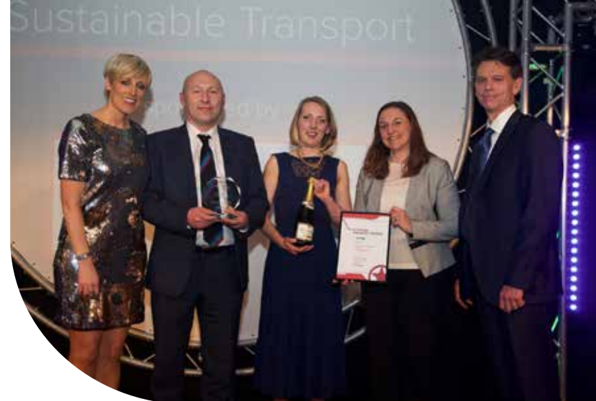
Camden won the 'Freight Consolidation Service' category at the London Transport Awards 2016.