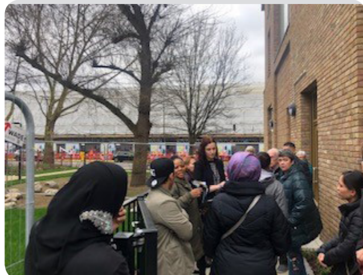
Residents on a site visit exploring the Options for Wendling and St Stephens Close.