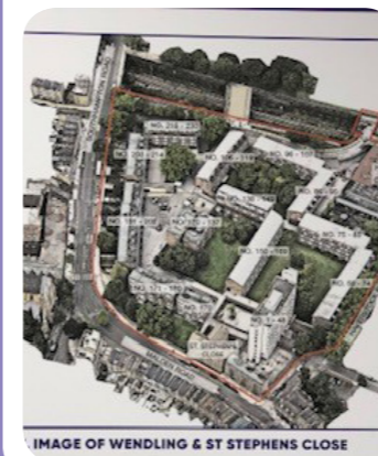
IMAGE OF WENDLING & ST STEPHENS CLOSE