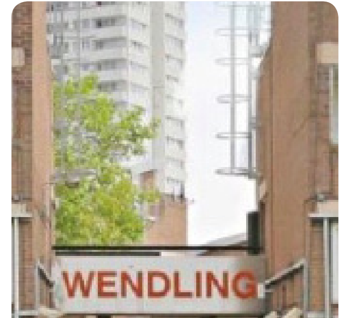
We Have Looked At Entrances, Exits & Signage