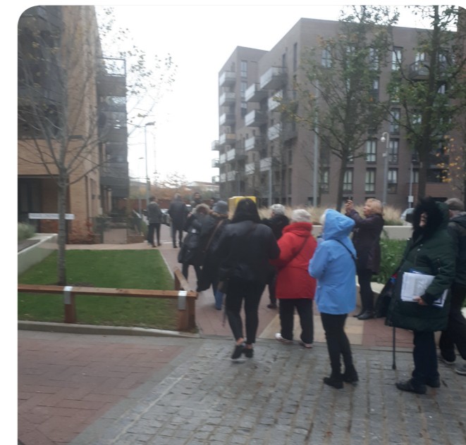
Recent site visit to the Leopold Estate