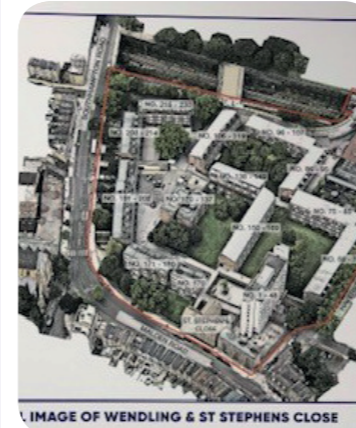
IMAGE OF WENDLING & ST STEPHENS CLOSE

Camden Council's Community Safety Officer for Gospel Oak has been alerted by police to possible scams, bogus callers and distraction burglaries that may be happening in the area. Bogus callers are people who pretend to be someone they are not, like a workman or a member of staff from a company, the callers to your home could be trying to distract you, looking to commit a distraction burglary, by trying to trick you to allow them into your home so that they can steal. Please be careful, always use the door viewer and chain if you have one. If you are unsure do not allow access and dial any of the following. 101 - for police non emergencies/safer neighbourhood team or 999 to report crime.